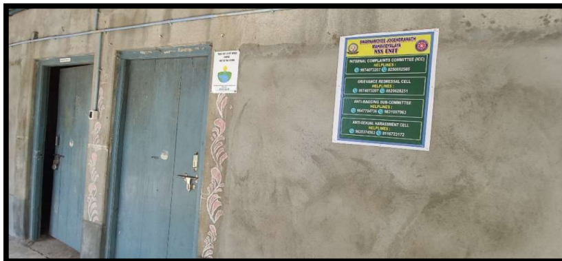
Helpline numbers displayed outside room nos. 16 and 17