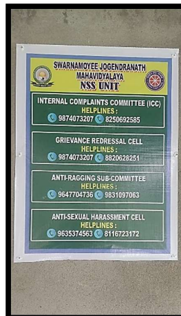
Placard with helpline numbers