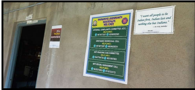
Helpline numbers displayed outside Botany laboratory