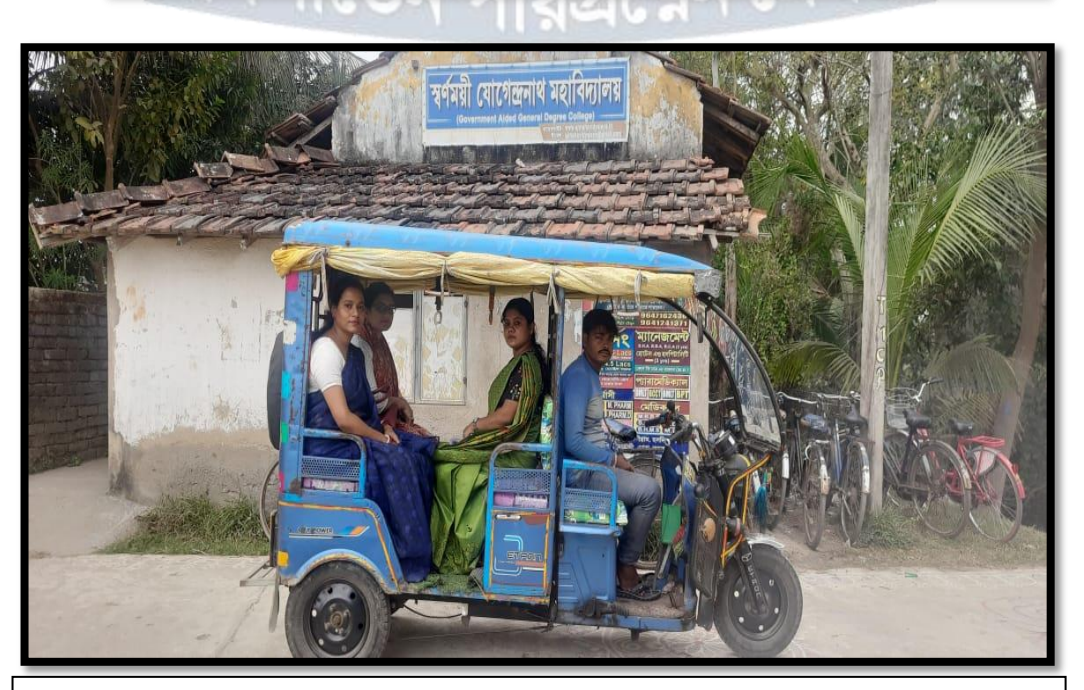
(To Save Energy and Reduce Air Pollution) Sharing of Car, Bike ,Toto by Teaching Staff to Attend the College