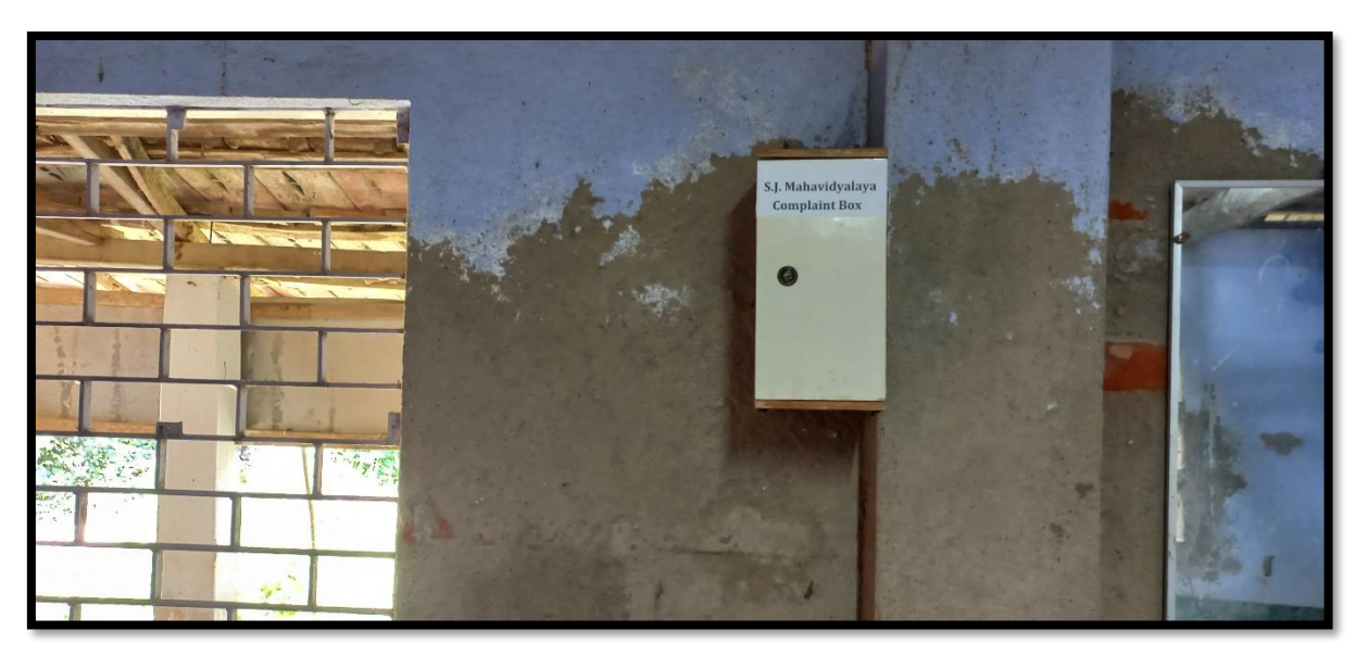
Complaint box in Girls' Common Room