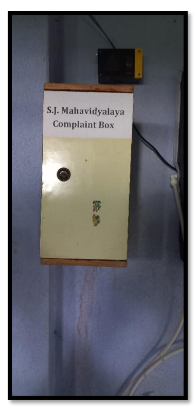
Complaint boxes in Boys' Toilet