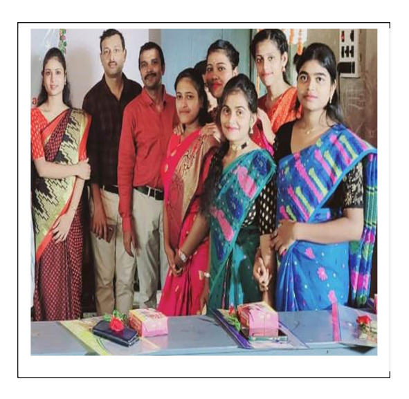
Photo Plate: At the end of the program, the principal and teachers of the department with the outgoing students.