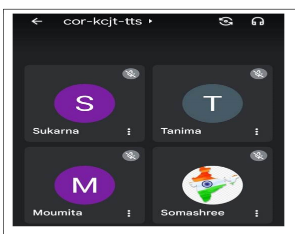
Photo Plate: Screenshots of the teachers and students from the Sanskrit Department's Fresher's Welcome Programme.