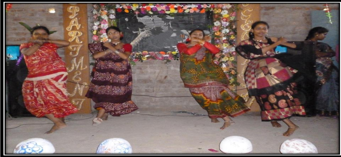
Students felicitating Guests on Freshers Welcome 14.08.2019