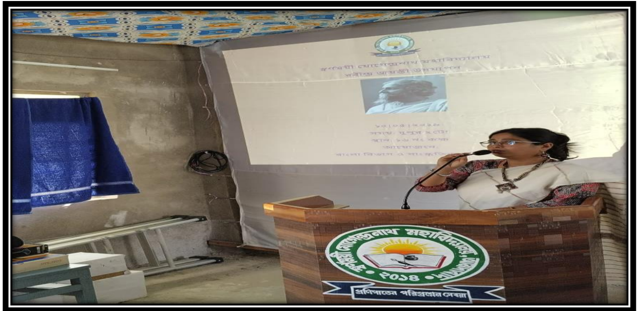
Student reciting poetry at Room no 16 on Rabindra Jayanti observation 10.05.2019