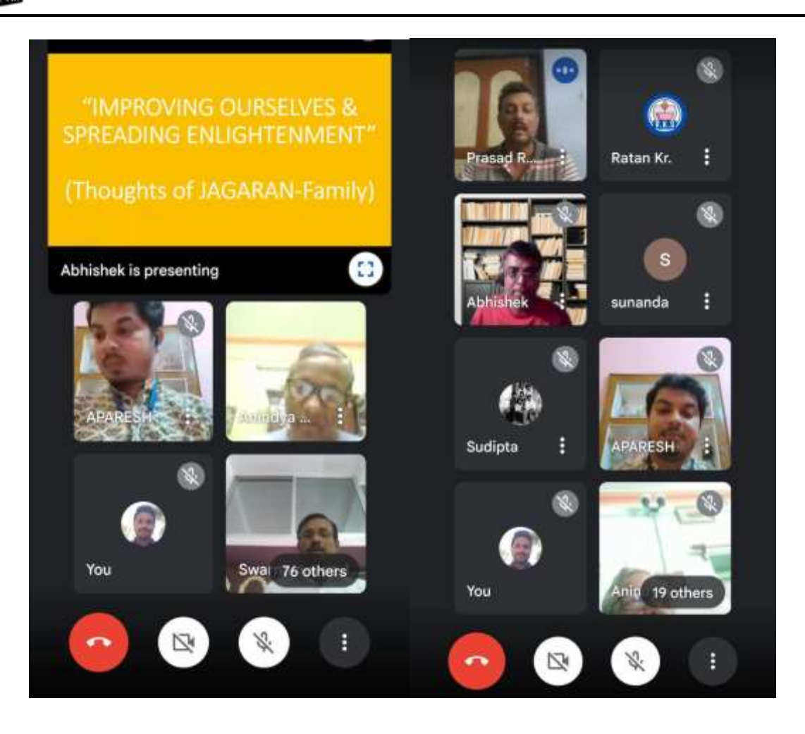
Photo Plate: Mobile Screenshots of Webinar held on 29/05/2022 at Google Meet Platform

Govt. Aided General Degree College | Estd.: 2014 P.O.: Amdabad, P.S.: Nandigram, Dist.: Purba Medinipur, PIN 721650 www.sjmahavidyalaya.in | Email: sjmahavidyalaya@gmail.com