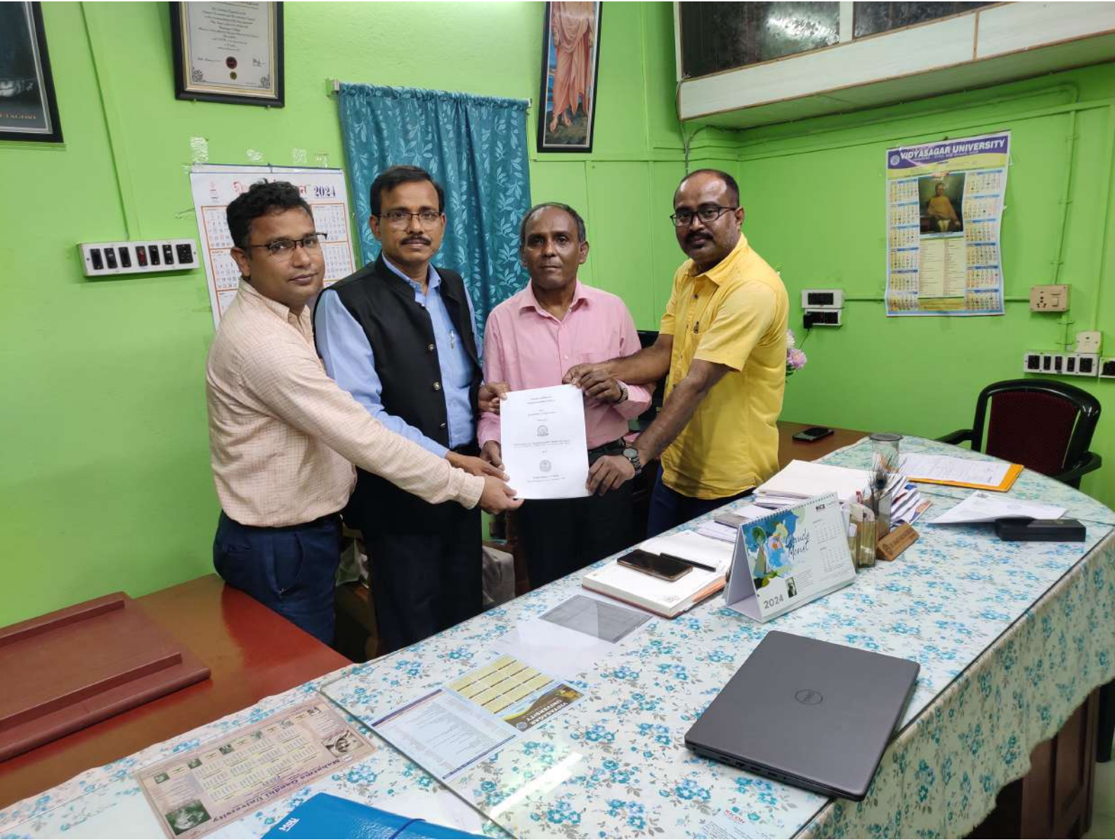
Photo Plate: After Signing of the MoU between Swarnamoyee Jogendranath Mahavidyalaya and Ramnagar College Date: 17/03/2022 Place: Ramnagar College