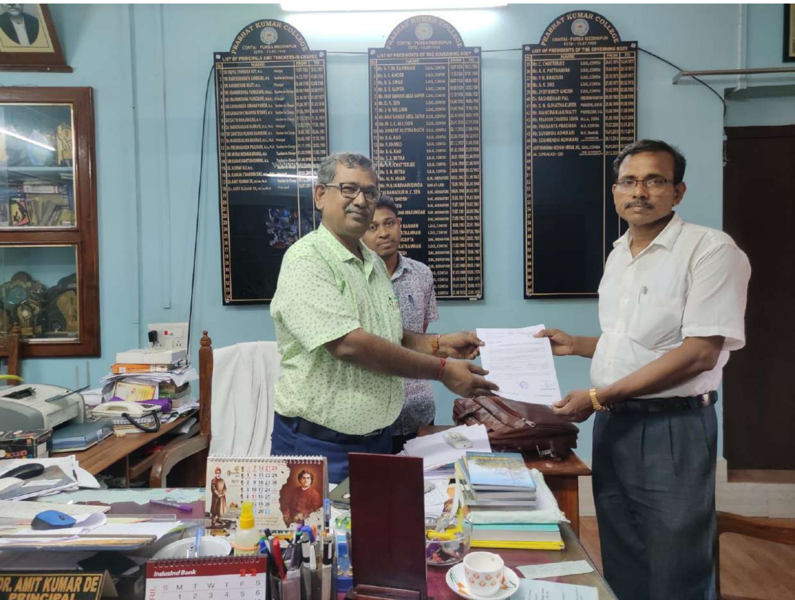
Photo Plate: After Signing of the MoU between Swarnamoyee Jogendranath Mahavidyalaya and Prabhat Kumar College, Contai Date: 30/08/2022 Place: Prabhat Kumar College, Contai