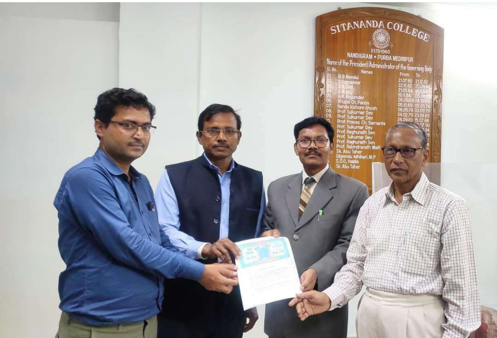
Photo Plate: After Signing of the MoU between Swarnamoyee Jogendranath Mahavidyalaya and Sitananda College Date: 12/05/2022 Place: Sitananda College