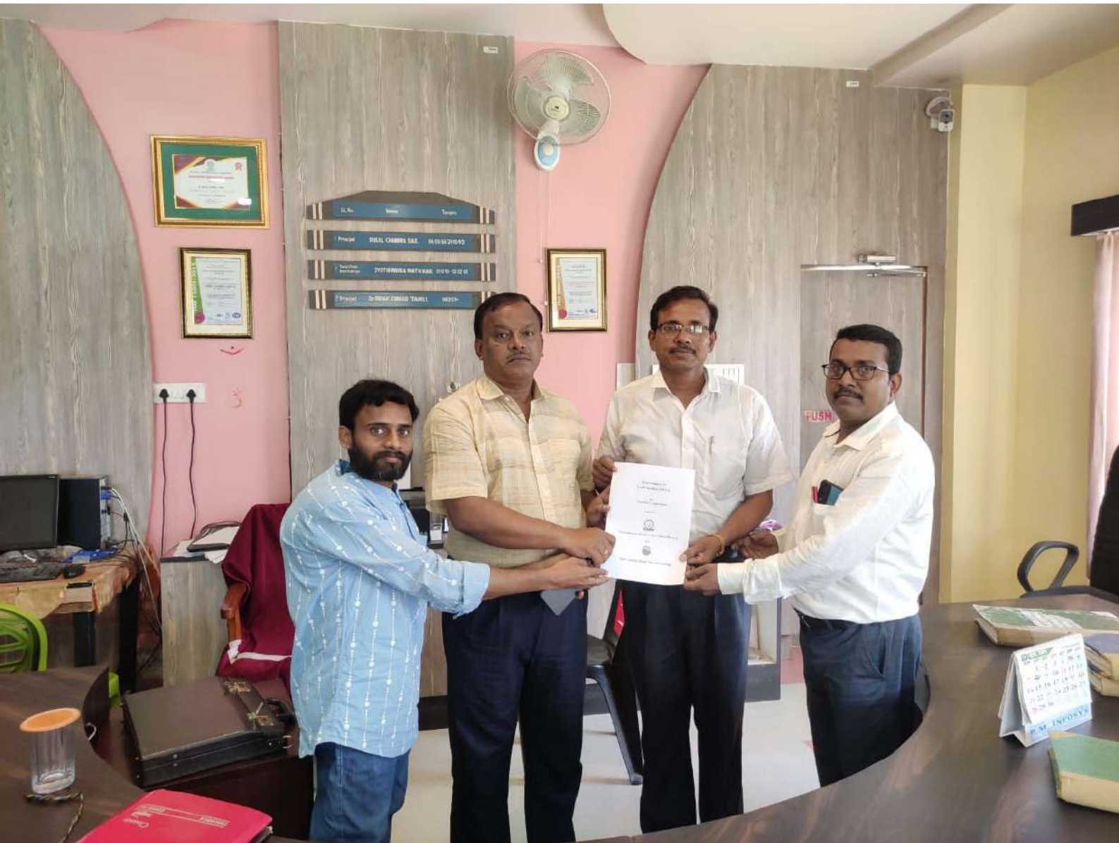
Photo Plate: After Signing of the MoU between Swarnamoyee Jogendranath Mahavidyalaya and Egra SSB College Date: 15/06/2021 Place: Egra SSB College